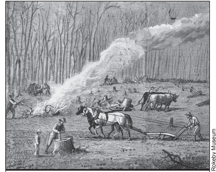
Clearing Up a Field by Roland Evans Robinson (in the early 1800s).

The struggle between the French and the English for control over land and the fur trade drew the Abenaki and other Native American groups into war. The clash played itself out through the 1740s and 50s, and warfare kept settlers away from the Vermont frontier. In 1754, the English, French, and Indian War, which would decide the conflict once and for all, began. Some Native American groups sided with the French, and others with the British. The British, owing to their stronger economic position and greater population, emerged victorious in 1763.